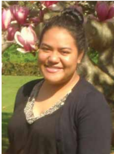
LEFT: Meressapinni Pupuali'i ... inspired by Mercy story to act with compassion.

"Although I'm not a Catholic, I strongly believe it's possible to see myself in the future