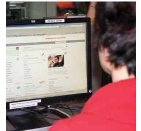
INTRANET: A staff member of Mercy Hospice checks the latest on the facility's intranet.

The intranet is available to all staff, including the managers of Mercy Hospice's seven shops, spread throughout the city. "As they work independently, without access