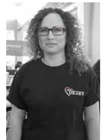
TOP: Heart launch participants gathered in the Glen Innes Library include a broad range of local leaders, including Sisters of Mercy who have lived and worked in the community for over 20 years.