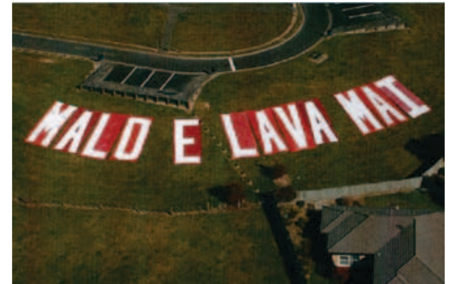
TONGAN mega welcome banner, made by Year 5/6 Syndicate at St Anne's School, Manurewa, and displayed during the World Cup Rugby competition in Totara Park in Manurewa. The letters are big enough to be seen from the air.

Founded by the Sisters of Mercy in 1952, St Anne's can boast of having had a Sister on its staff ever since. "The main thing that