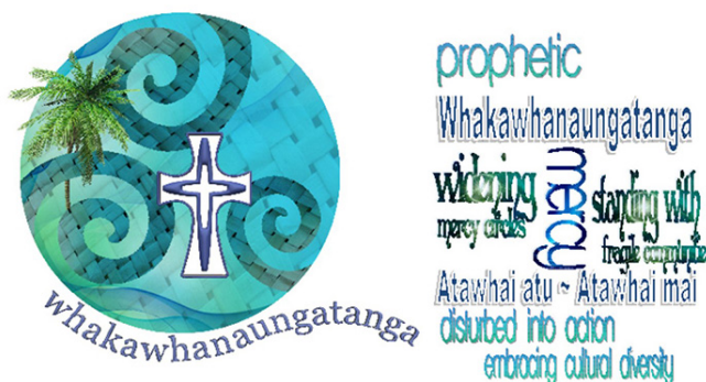
Te Whakaminenga Chapter 2014 Nga Whaea Atawhai o Aotearoa Sisters of Mercy New Zealand

As this reflection is circulated, many Māori and an increasing number of Pākehā are celebrating Mātāriki, the Māori New Year, marked by the appearance in the early morning sky of the cluster of stars also known as the Pleiades or Seven Sisters. Traditionally, this has been a time for Māori to remember with love their tūpuna or ancestors, to visit cemeteries and tidy graves, and to tell the