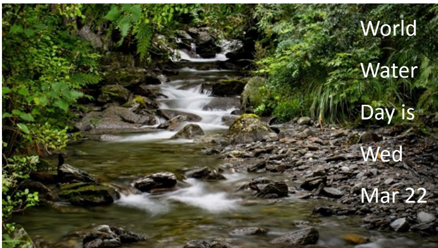
A fresh swimmable West Coast river